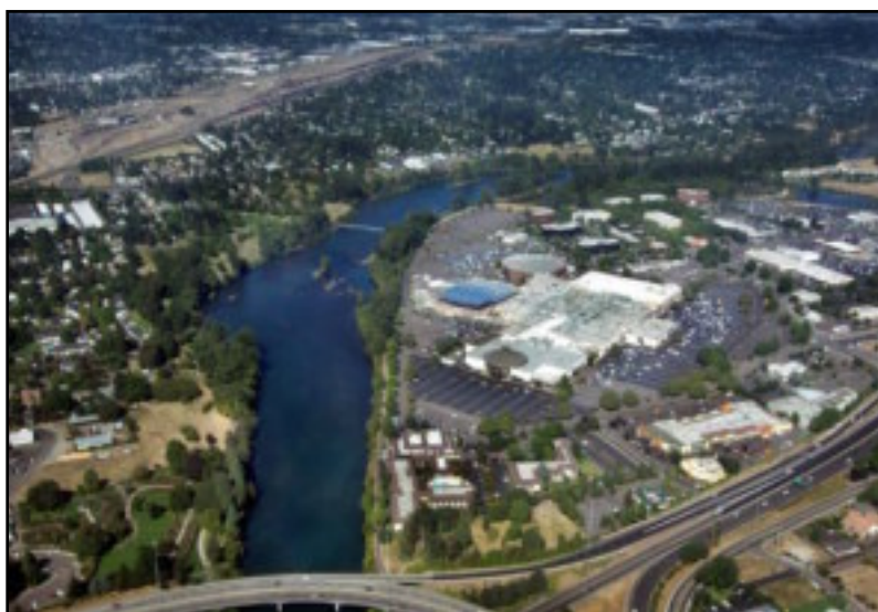
Aerial view of Willamette River in Eugene