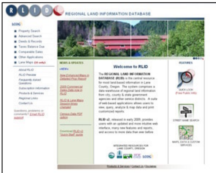
View the RLID website at http://v2.rlid.org/

The Urban and Regional Information Systems Association (URISA) have announced their 2009 ESIG award winners. URISA's ESIG Awards recognize exceptional