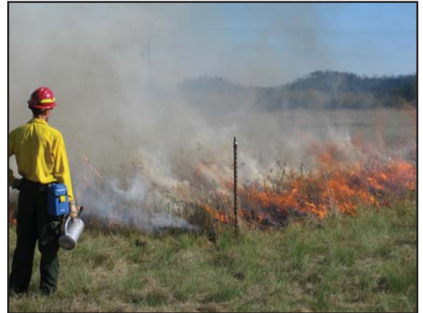
Use of fire as a management tool is one of several techniques being evaluated under an EPA-funded research grant.

The experiment is being conducted at Coyote Prairie, which is located to the west of Eugene. The management techniques were successfully applied to a total of fifty test plots over this past summer. The next phase of the study will include over-seeding with native grasses and forbs and monitoring the results over the next two growing seasons. For more information, contact Jeff Krueger at jkrueger@lco.org .