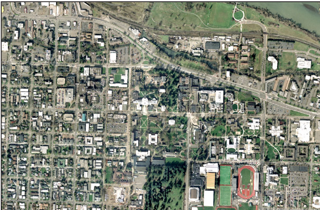
New Orthophotography was used for Olympic Trial Public Safety efforts.

Deep winter snow cover and cloudy spring weather conditions delayed flights up the McKenzie River and across portions of western Lane County where additional high (6-inch) and medium (one-foot) resolution aerial imagery were flown in late June and July. Orthos from these flights are eagerly anticipated by EWEB and Lane County, in particular, for support of mapping, environmental monitoring, and a variety of other projects. The next regional ortho acquisition project is anticipated in 2010.