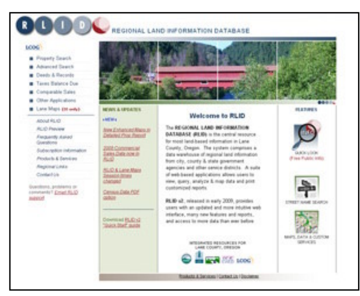
View the RLID website at http://v2.rlid.org/

The Urban and Regional Information Systems Association (URISA) have announced their 2009 ESIG award winners. URISA's ESIG Awards recognize exceptional