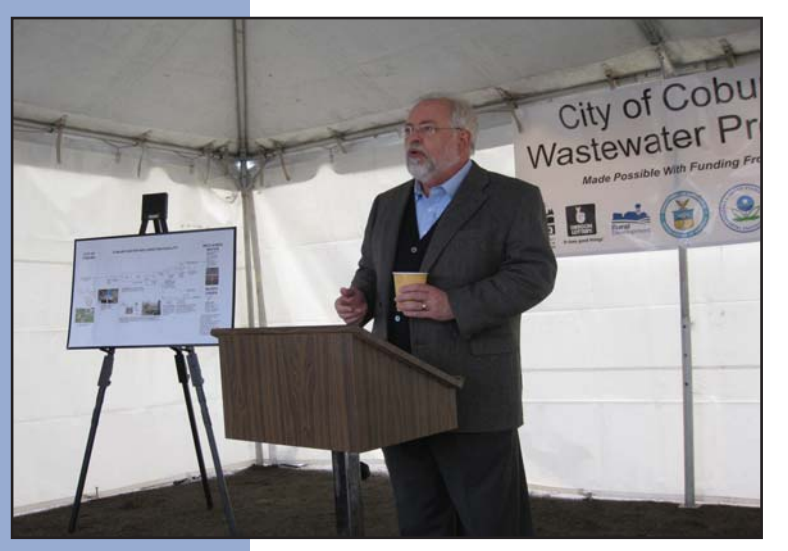
State Representative Phil Barnhart speaks at groundbreaking.

The City of Coburg celebrated an official groundbreaking to commemorate the start of construction on the Coburg Wastewater Project Phase 2 and 3—the treatment facility and collection system—on Friday, November 4th, 2011 at the future treatment facil-