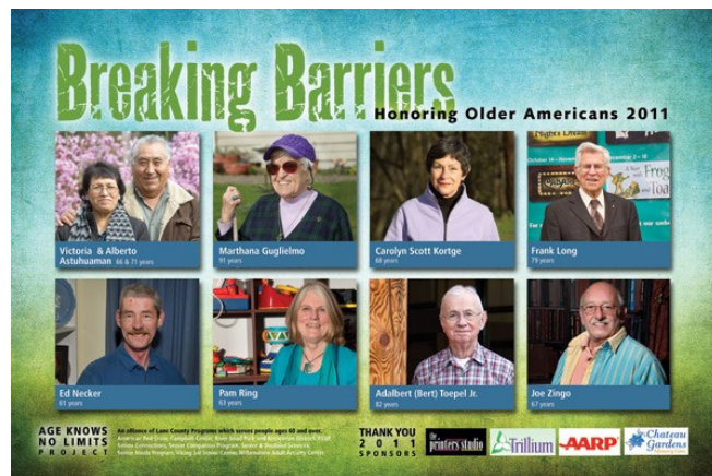
2011 Theme: Breaking Barriers