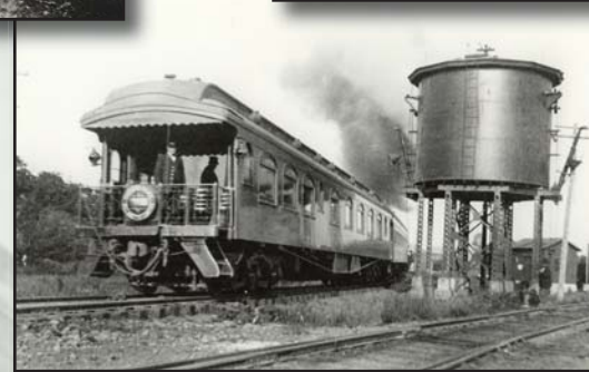
The "Willamette Limited" passenger train leaving Springfield, headed towards Coburg. 1913.

Two routes of the Applegate Trail were located through Lane County, later becoming River Road, Highway 99, and Territorial Road