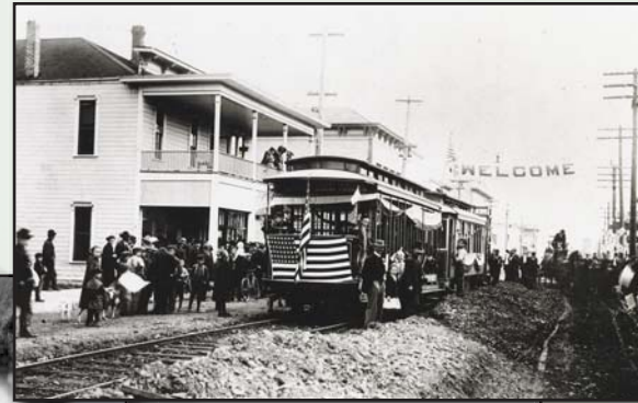
Arrival of the first streetcar in Springfield circa 1910. The Eugene-Springfield streetcar operated from 1910 to 1926.