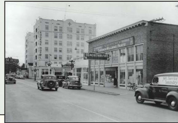
9th Avenue (now Broadway) between Oak and Pearl in downtown Eugene circa 1938.