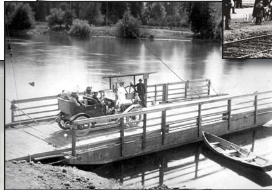
Deadmond Ferry on the McKenzie River, north of Springfield, east of the Interstate-5 bridge. 1914.