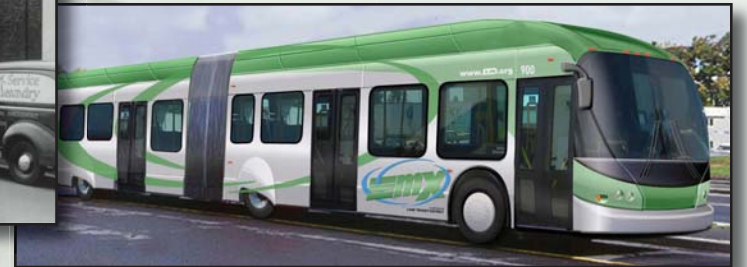
The Lane Transit District Emerald Express began operating between Eugene and Springfield in 2007.