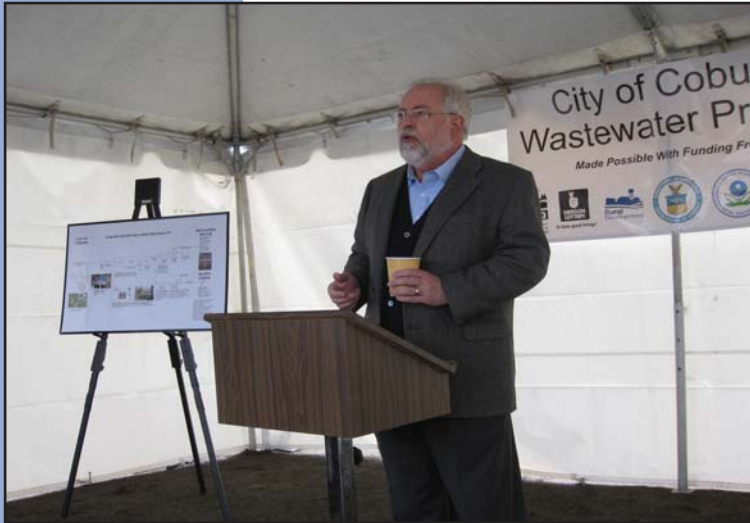
State Representative Phil Barnhart speaks at groundbreaking.

The City of Coburg celebrated an official groundbreaking to commemorate the start of construction on the Coburg Wastewater Project Phase 2 and 3—the treatment facility and collection system—on Friday, November 4th, 2011 at the future treatment facility site. Federal, state, and local elected officials, including representatives for Congressman DeFazio and Senator Wyden and Representative Phil Barnhart spoke about the state and regional support that this project has received for over a decade. Speakers also discussed the project's positive environmental, economic, and livability impacts. Mayor Judy Volta, city councilors, funding agencies, businesses, and residents joined in honoring this important community investment.